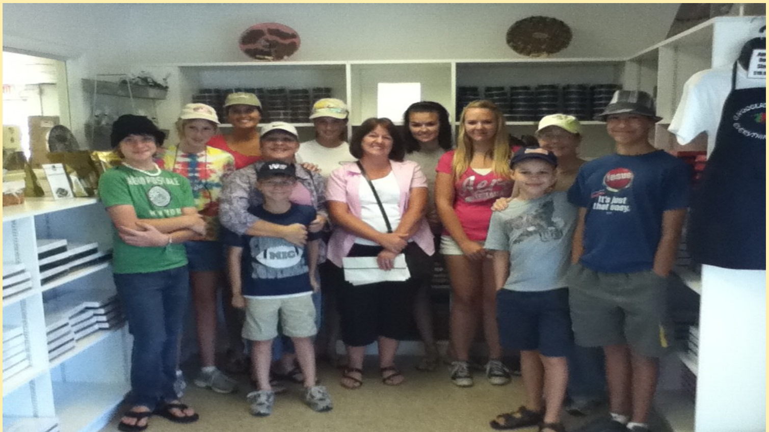
Grimaldi's Chocolate Field Trip- October 14, 2011