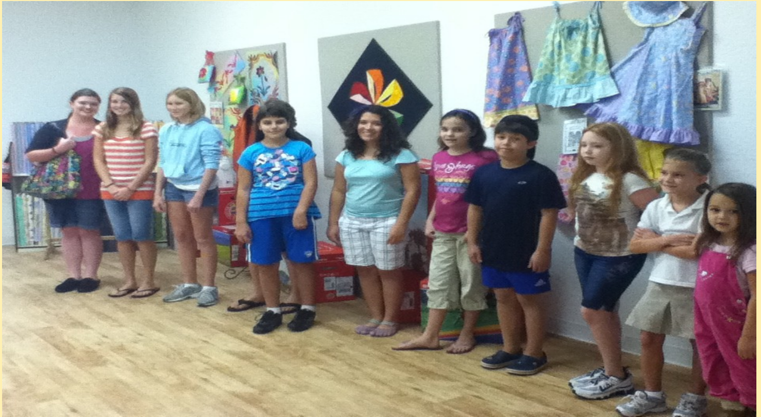
Sew Central Field Trip- October 18, 2011